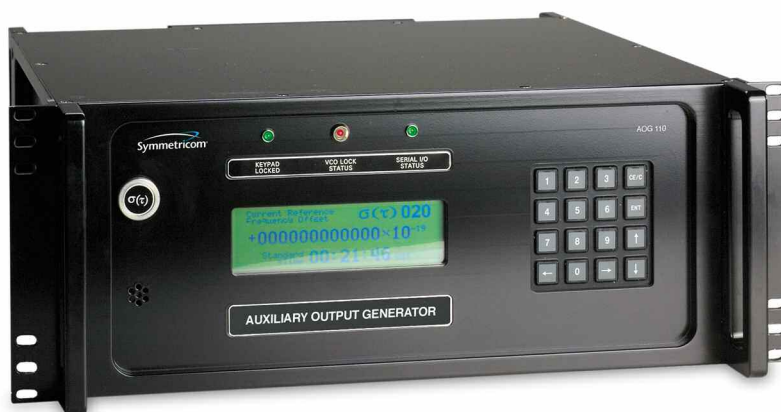
AOG-110 Auxiliary Output Generator

The output frequency is controlled by directly offsetting a phase accumulator (synthesizer) in the PLL chain. The maximum synthesized fractional frequency range is \pm 1E-7 , with a fractional resolution of 1E-19 . By altering the frequency output over a precise time interval, output phase control is achieved. Typically, the user defines the desired phase offset and time interval within which the offset is made. Once set, the AOG-110 automatically implements the appropriate frequency offset and precise time interval. Direct control over both frequency and time interval is available.